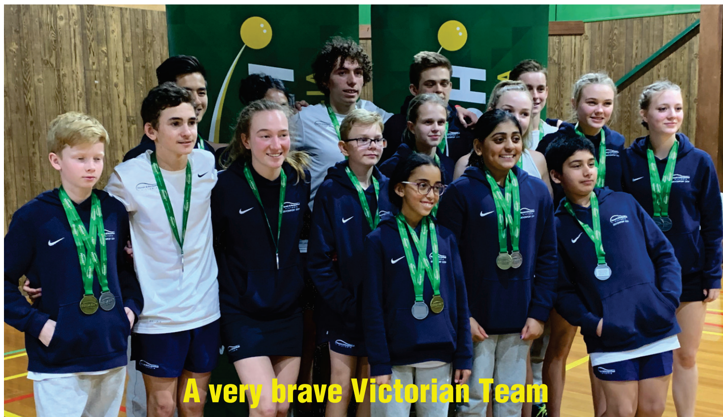
A very brave Victorian Team